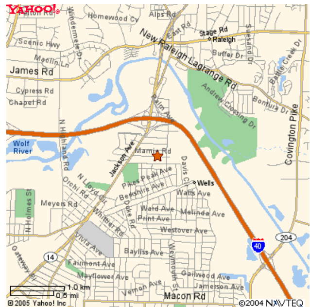
--map from Yahoo Maps